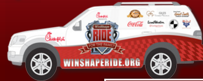
Each Vehicle Wrap Recognition