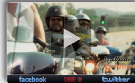
Daily Ride Video