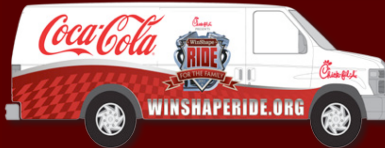
One Vehicle Wrap Sponsor