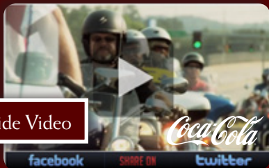
Daily Ride Video