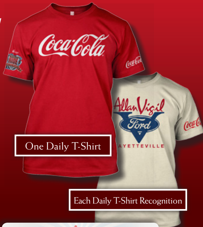
One Daily T-Shirt