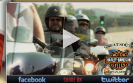
Daily Ride Video